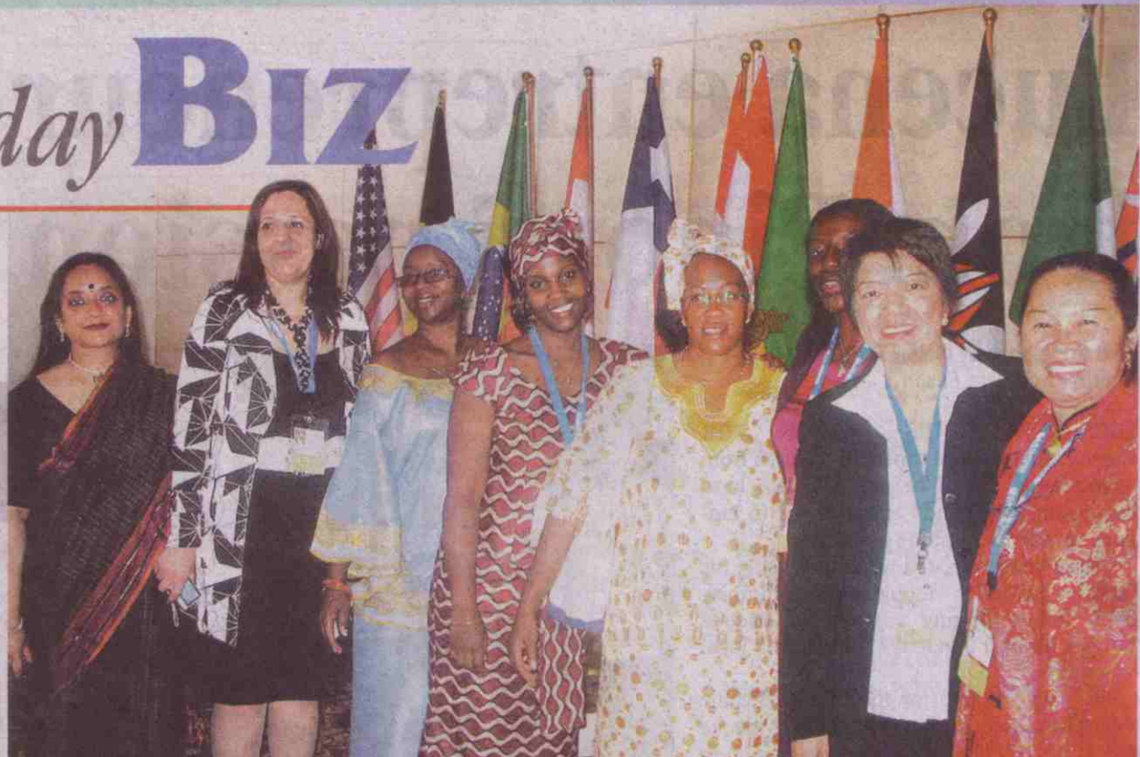
CIDA delegates proudly pose in front of their country flags.

'Women are not afraid to fail. We have hits and misses ... but we rise up without losing face'