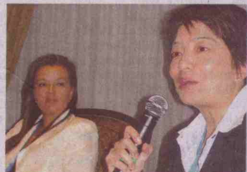
THE AUTHOR (right) talks about women leaders in the Philippine setting.

(The author is chief executive officer of Figaro Coffee Corp. and president of the League of Corporate Foundations.)